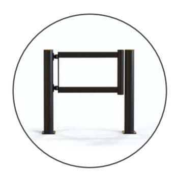
Swing Gate (Short) Hydraulic self-close feature automatically returns the gate to its closed position after use to maintain safety.