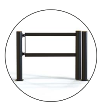
Swing Gate (Long) Extended gate length with additional post support for enhanced strength and stay-open access option.