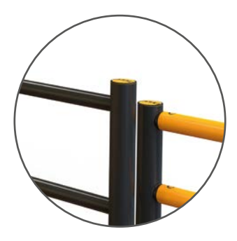
Ultra-low maintenance material is chemical and water resistant, non-corrosive, non-scratch and self coloured so no repainting, rusting, flaking or corrosion.