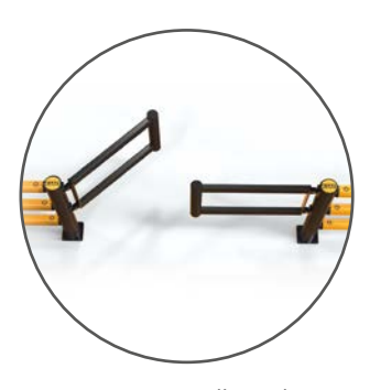
Twin-gate option allows the gate to be installed in pairs to provide a maximum opening of 2400mm for the Short Swing Gate and 4000mm for the Long Swing Gate.