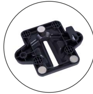
Reverse of unit showing the magnetic attachments