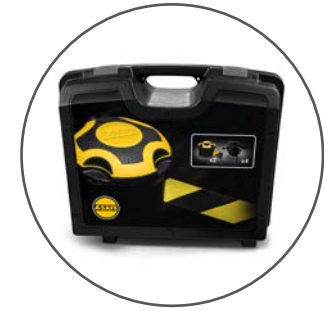
Products supplied in a robust carry case