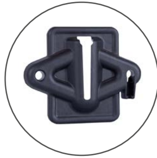
4 x receiver units Attachment unit can be fitted using magnetic or cord-mounted fitments.