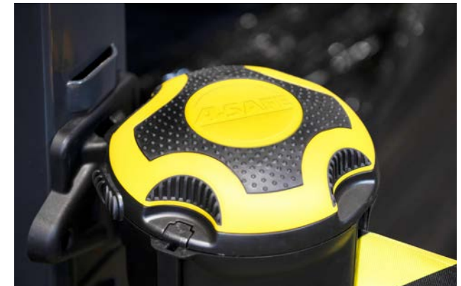
Tape reel attached via magnetic fitting