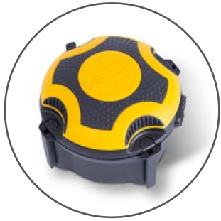
2 x lockable self-retracting 354 1/2 inch tape reel