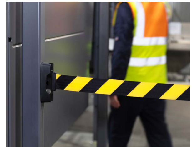
Racking receiver unit attached to a metal beam.