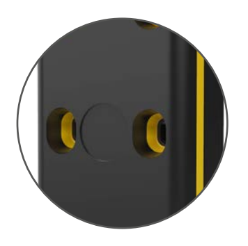
Recessed fixing locations prevent contact with vehicles, ensuring the cushioning effect is unhindered.