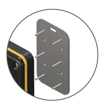
Dock Buffer weld plate for easy installation. Available to order at additional cost.